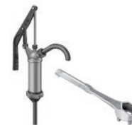
Drum Pump & Drum Wrench for 55 Gal.