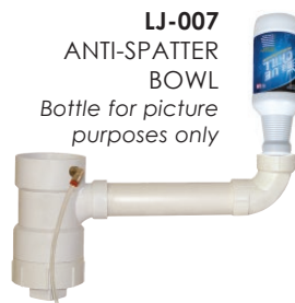
LJ-007 ANTI-SPATTER BOWL Bottle for picture purposes only

The Anti-Spatter Bowl prevents spilling and the need for constant refills. Using a 32 oz. bottle, gravity feeds the solution as needed. Perfect for nozzle dipping in manual/robotic applications.